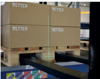
Precise targeting by using a cross laser