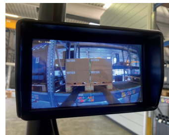
Monitor display in driver's cab