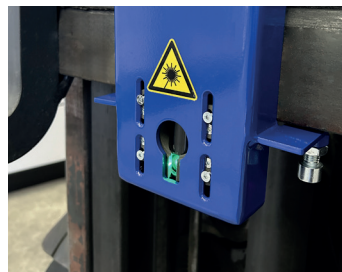
Cross laser green, protection class 1M