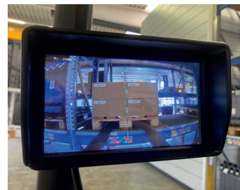
Monitor display in driver's cab