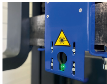
Cross laser green, protection class 1M