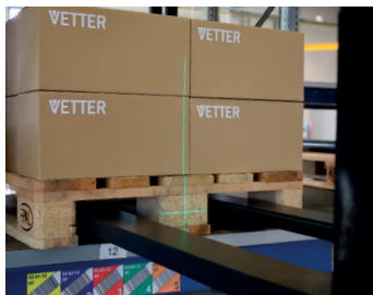
Precise targeting by using a cross laser