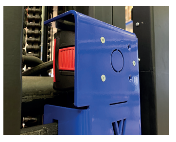
Wireless power supply with VETTER SmartSupply