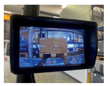
Monitor display in driver's cab